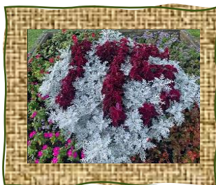
Fair Quilt Garden (with 175 in center)