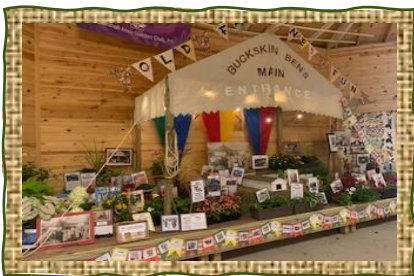
MAGCI Floral Hall Display